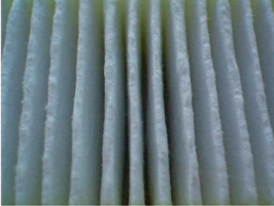
New HEPA Filter for comparison