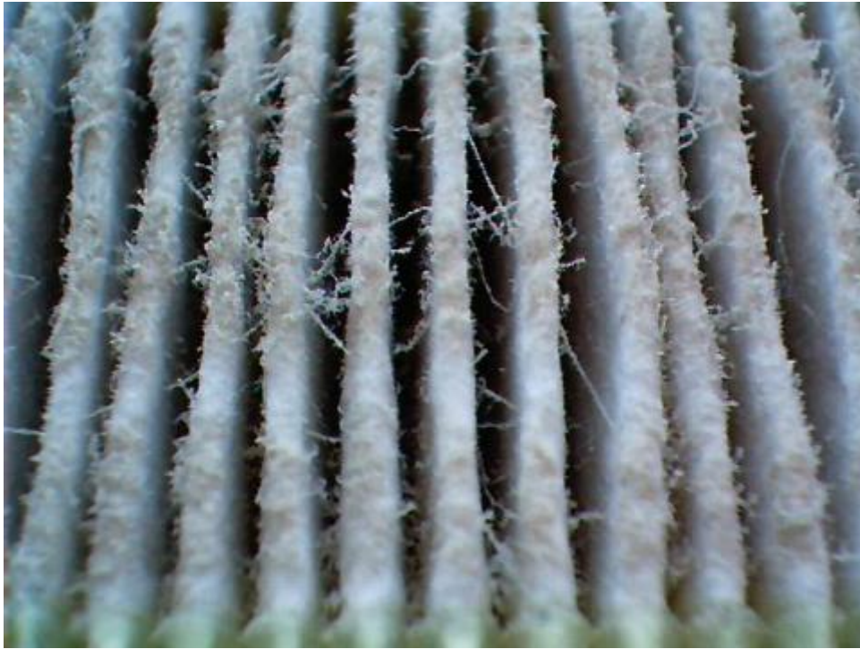
HEPA Filter in residential service(indoor) for approximately 3 weeks.