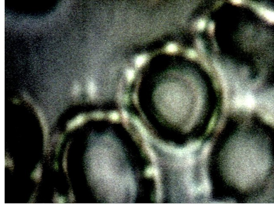
A sample of the blood of the 11 year old canine subjected to high magnification. Additional damage to the integrity of the erythrocytes of the 11 year old dog exists in comparison to the other sample. Approx. magnification is 10,000x.