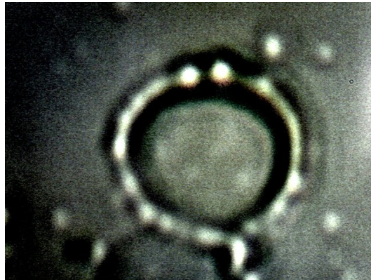
Additional instances of the chlamydia-like organism external to and attached to the exterior of the canine erythrocyte wall are visible. Please see A Mechanism of Blood Damage and Live Analysis for further information on human studies. This particular organism is a central focus by this researcher on the Morgellons conditions. Approx. magnification is 10,000x..